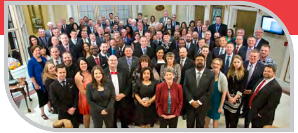
The 2015 G4S Canada Summit Award winners and management team

At its core, G4S's greatest strength is its people – a family of individuals committed to customer service and the safety of others. With nearly 10,000 Canadian employees, acts of courage and bravery are nothing new at G4S, however only so many of these stories are heard and celebrated. On February 24th, G4S Canada celebrated the 2015 Summit Awards, an evening in Niagara to acknowledge these stories and to honor the individuals who are making a difference in the lives of others.